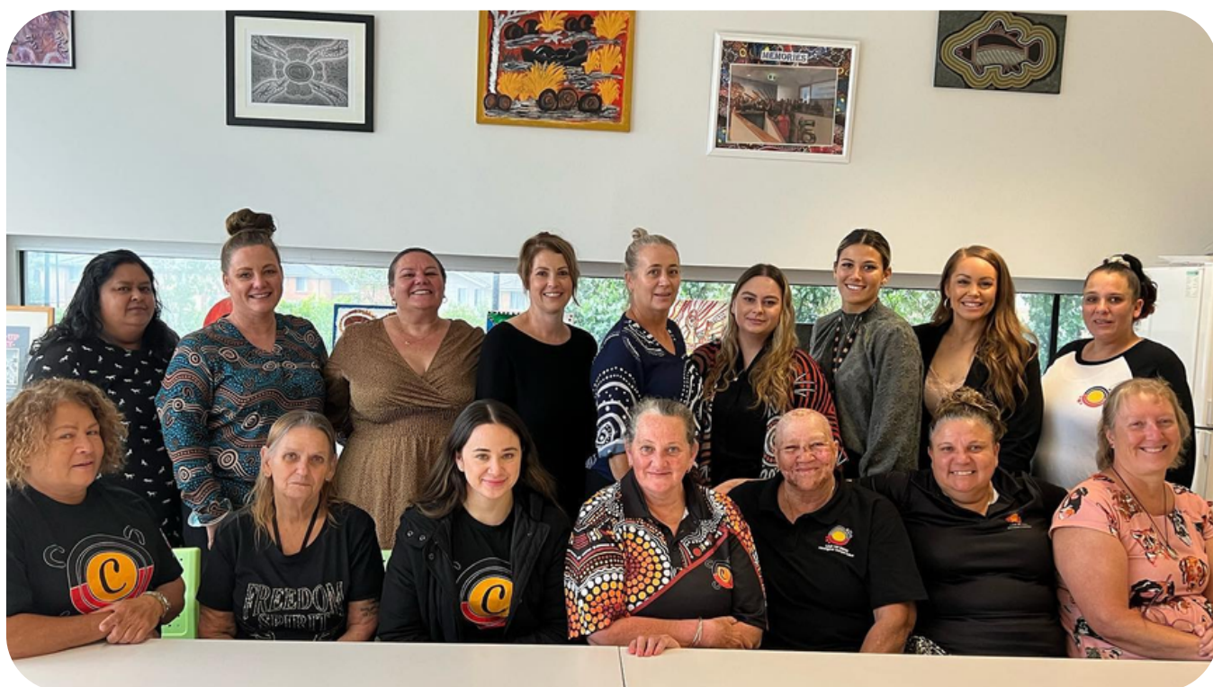
LINK-UP (NSW) FEMALE STAFF & BOARD MEMBERS